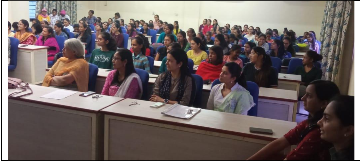
Convener & Activity Head, Women cell, GECC