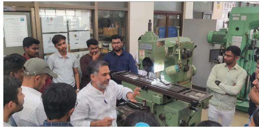
Demonstration of FSP