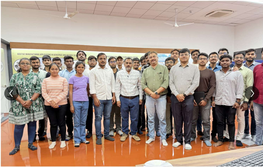
Mech and Mechanical Department students and faculties at PDEU, Metal Additive Manufacturing Process Lab

It was excellent opportunity to showcase advanced manufacturing capabilities of PDEU.