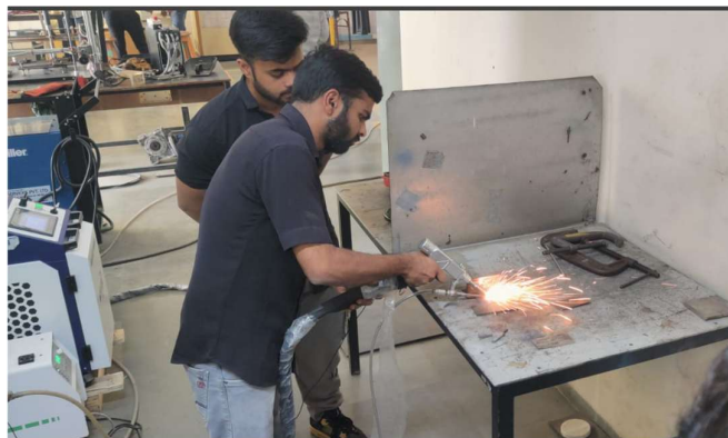
Demonstration of Laser Welding