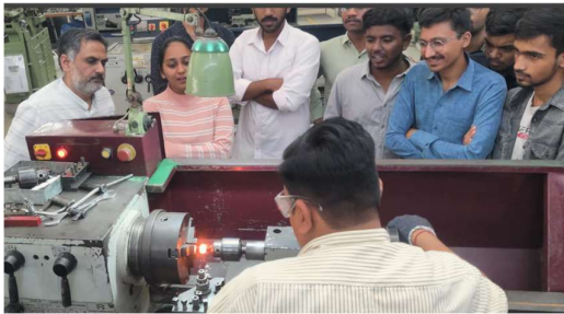
Demonstration of FW